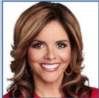
2018 Jane Velez-Mitchell