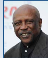
2011 Lou Gossett, Jr.