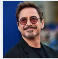
Robert Downey, Jr.