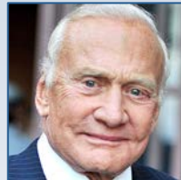
2012 Buzz Aldrin