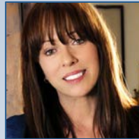
2016 Mackenzie Phillips