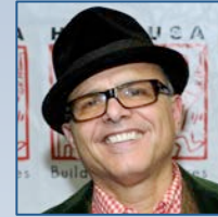
2015 Joe Pantoliano